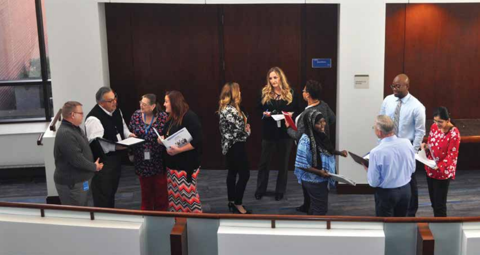
The new MDwise location in Indiana features prominent branding and expanded space for employee collaboration.

system focuses on automating the process. “An electronic data file comes in, it’s read by the system automatically, and approved or declined without human processing,” says Kendall. “That brings significant savings in resources and manpower, and also pays providers much quicker.” The combined MDwise/McLaren claims process has hit 90 percent on electronic adjudication, and with 3.9 million claims processed yearly through MDwise alone, the savings compound fast.