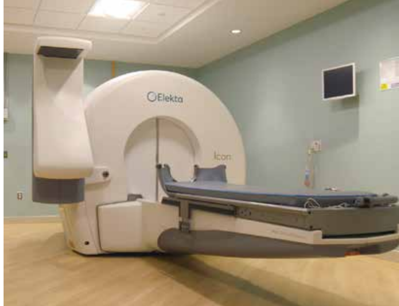
The new Leksell Gamma Knife Icon at the Weisberg Cancer Treatment Center provides state-of-the-art treatment as part of the Karmanos Cancer Network.

Also this year, The Lawrence and Idell Weisberg Cancer Treatment Center in Farmington Hills is in the midst of a major $47 million expansion. The first phase of this development features the Leksell Gamma Knife Icon, the most precise stereotactic radiosurgery system (SRS) currently available. Gamma knife surgery, which is actually radiation treatment, allows precise, non-invasive targeting of intracranial (brain, brain stem, the trigeminal nerve) tumors. Tighter, more intense