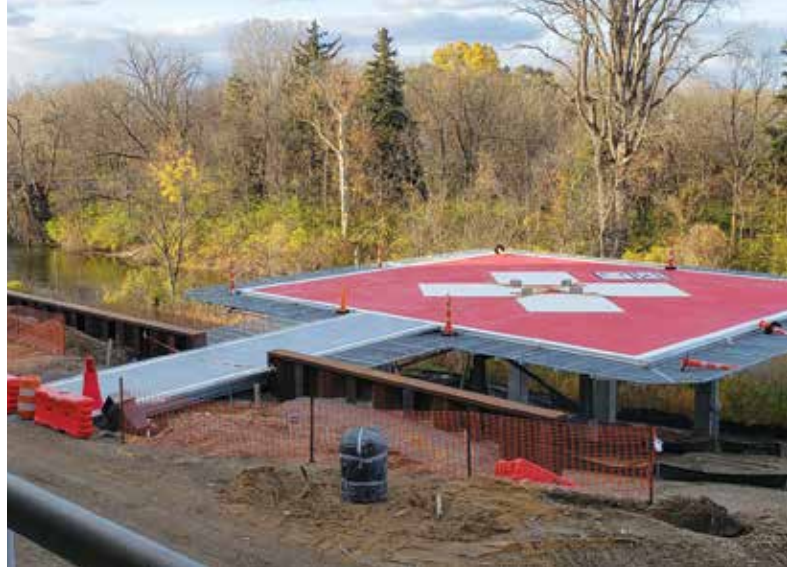
With hospital campus property a premium, the new helipad at McLaren Macomb has been constructed above the Clinton River.

A $27 million medical office building for McLaren Lapeer Region will be complete by 2021, and new