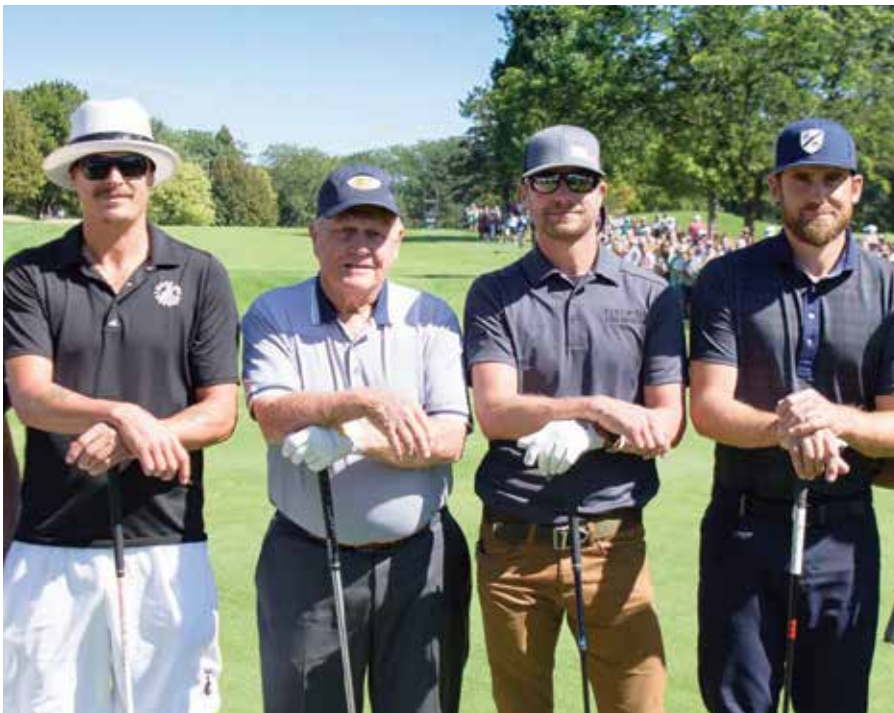
Celebrity foursome participants Kid Rock, Jack Nicklaus, Dierks Bentley and Henrik Zetterberg drew more than 12,000 fans to the golf tournament on Saturday.

Challenge Presented by McLaren features a week-long celebration of entertainment. Capping the 2019 event was a concert by chart-topping country singer Dierks Bentley and a special "celebrity foursome" that featured golf legend Jack Nicklaus, musician Kid Rock, hockey great Henrik Zetterberg and Bentley in friendly competition to further benefit charity. The 2020 event promises to be even bigger and better, taking place July 27-August 2 in Grand Blanc, the home of McLaren's corporate headquarters.