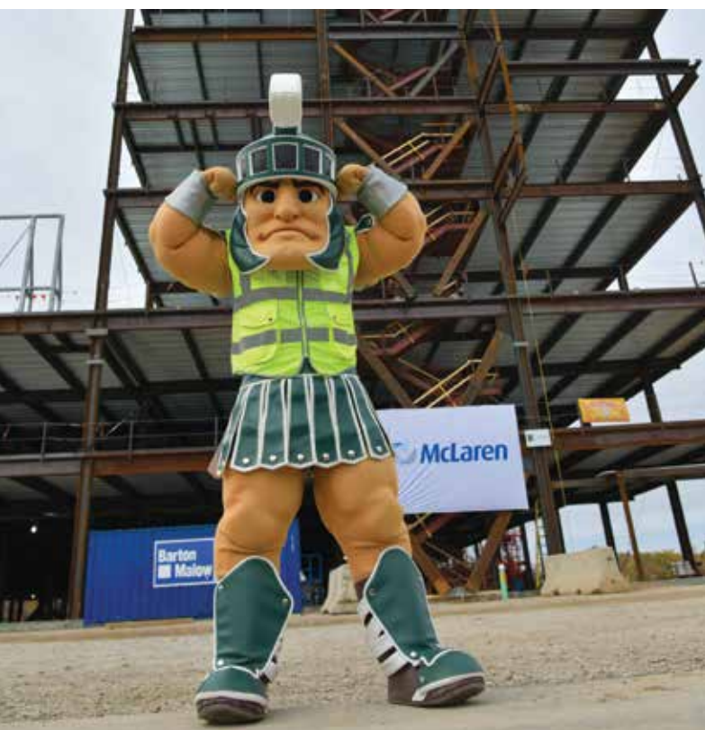
MSU mascot Sparty monitors progress of the new McLaren Greater Lansing hospital being constructed on the campus of Michigan State University in East Lansing.

Thus, part of McLaren’s commitment to our communities has been willingness to invest in their futures. Among such projects is major renovation at McLaren Port Huron. “We’re in Year Four of a $160